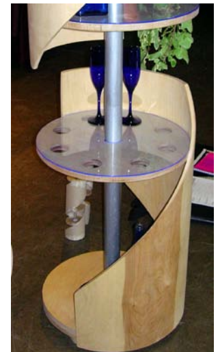
BELOW: A range of AS Level Extended Task – Lighting Unit examples: