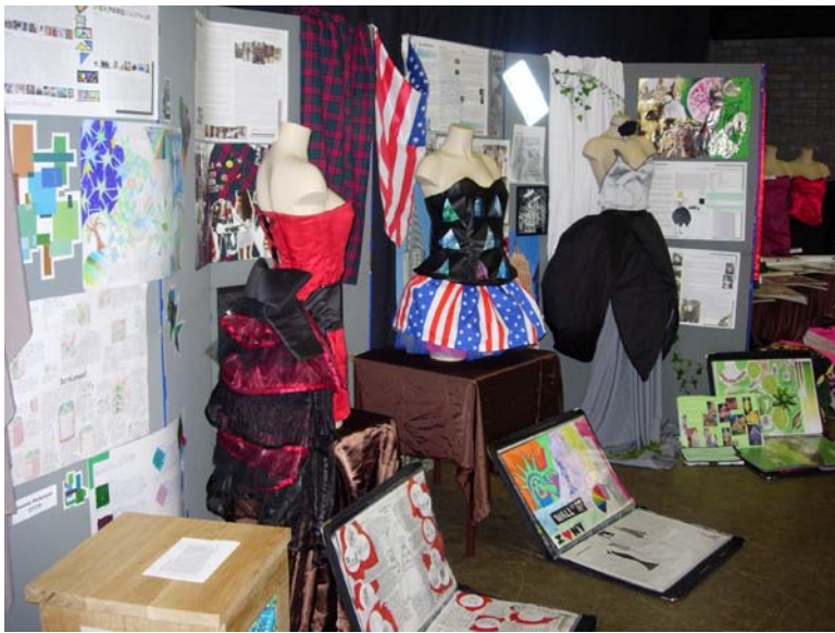
ABOVE: A Level Product Design