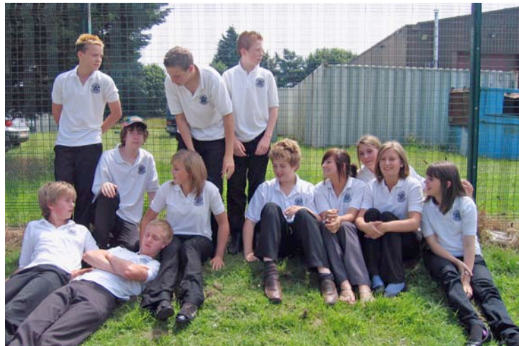
10C at the 'Pencampau' Studios - 2009

Please fill in the form below and leave it with us at the end of the night.